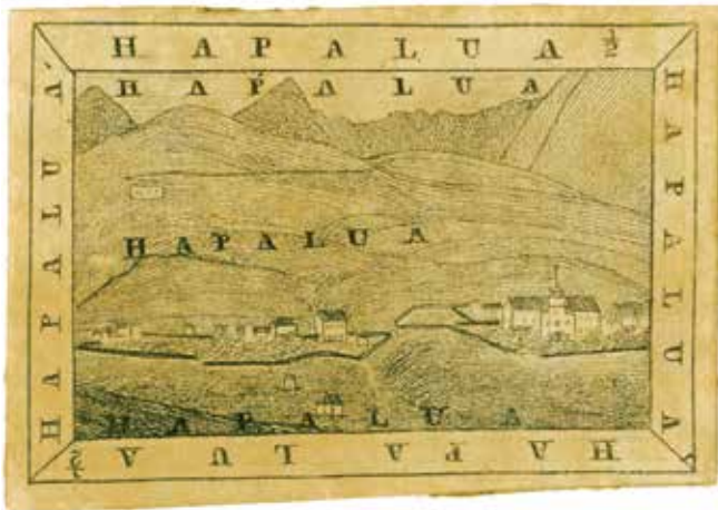
Fig. 7: Laihanaluna Seminary, Maui, 1843. Hapalua (half dollar) scrip. 56 × 39mm (images enlarged). (Hawaiian Mission Children's Society Library & Archives).