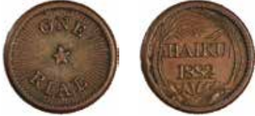
Fig. 23: Haiku Plantation, Maui, 1882. Copper 'rial' token (ANS 0000.999.20267). 22 mm.