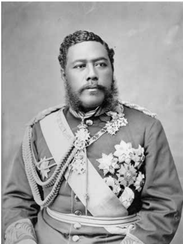
Fig. 25: "King of Hawaii David Kalakaua," ca. 1882.