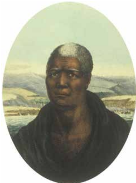
Fig. 6: Louis Choris, "Tammeamea, roi des iles Sandwich," from Voyage pittoresque autour du monde . Paris : Imprimerie Firmin Didot, 1822.