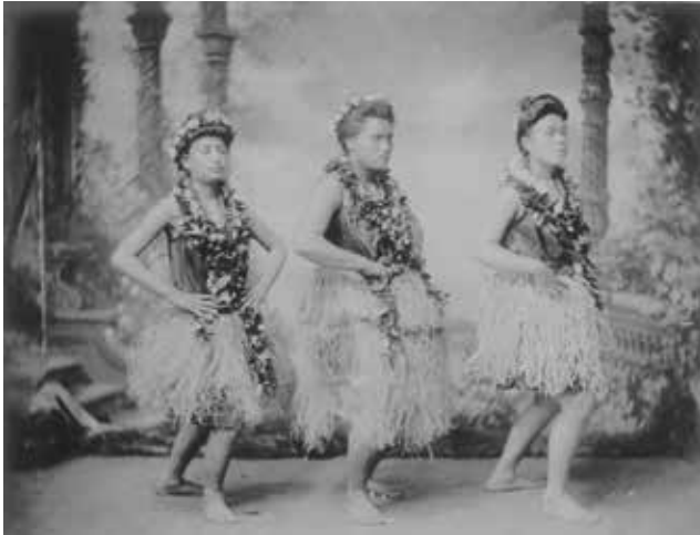
Fig. 18: Three hula dancers, ca. 1890. (Hawaii State Archives).