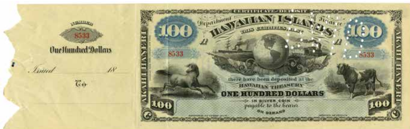
Fig. 15: United States, 1879. Hawaiian Treasury $100 Certificate of Deposit. American Bank Note Company (Hawaii State Archives). 198 × 94 mm (images reduced).