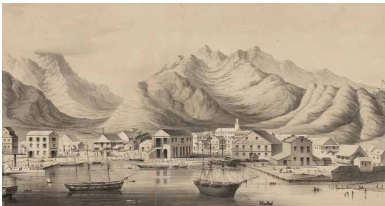
Fig. 13: Paul Emmert (artist), G. H. Burgess (engraver), View of Honolulu from the Harbor. San Francisco: Britton & Rey, 1854.