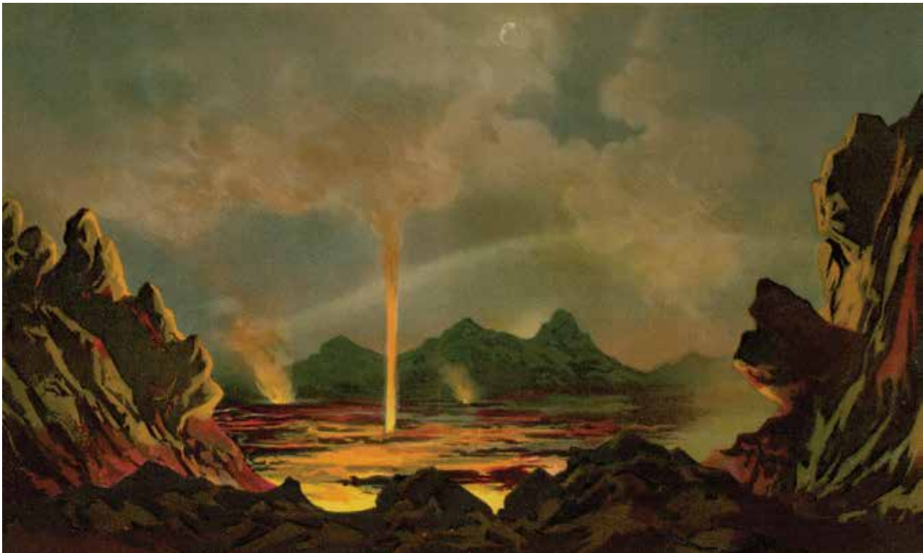
Fig. 20: After Jules Tavernier, "Burning Lake of Kilauea, Hawaiian Islands" from The Wasp. December 1884. Schmidt Label & Litho. Co.