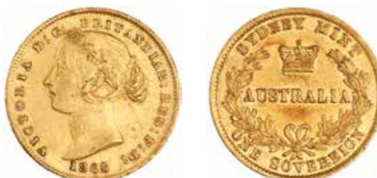
Fig. 17: Australia, 1865. Gold sovereign. (ANS 0000.999.38144). 22 mm (images enlarged).