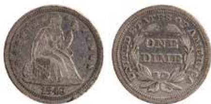
Fig. 16: United States, 1849. Silver dime. (ANS 0000.999.4796). 15.5 mm (images enlarged).