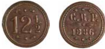
Fig. 24: Grove Ranch Plantation, Maui, 1886. (Copper 12 ½ cent) token. (ANS 1918.999.166). 21 mm.