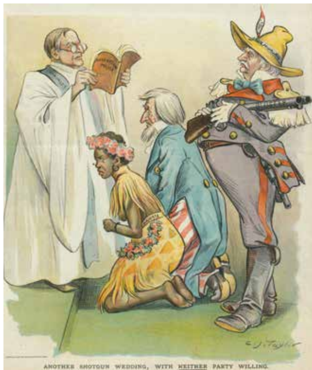
Fig. 31: Taylor, Charles Jay. "Another shotgun wedding, with neither party willing," Puck. December 1, 1897. (Library of Congress).

prior independence of the islands, and the United States Congress took steps to remove it from circulation in early 1903. The law provided for the redemption of silver certificates until January 1, 1905, after which it became "unlawful to circulate the same as money." 57 It also declared that Hawaiian silver coins would not be legal tender after January 1, 1904, though they could be exchanged at par for American currency until then. The balance of Hawaiian silver was subsequently shipped to San Francisco and recoinced as United States coins. Many Hawaiians, whether simply as a memento or as an expression of solidarity with the subverted kingdom, made their Kalākaua coins into necklaces, pins, and other decorative objects.